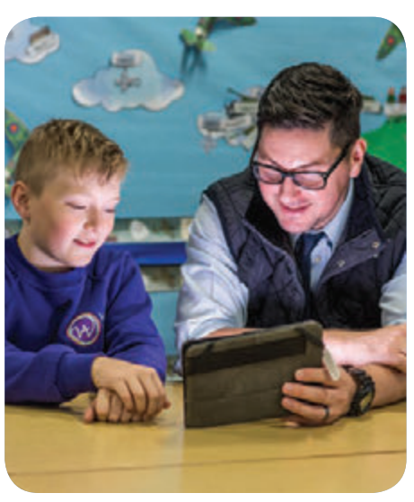
Inspiring the next generation